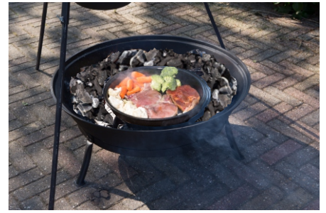
Fill the VESUV