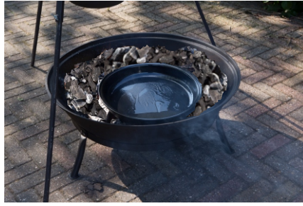
Place the bottom of the Vesuv on to the glowing coals