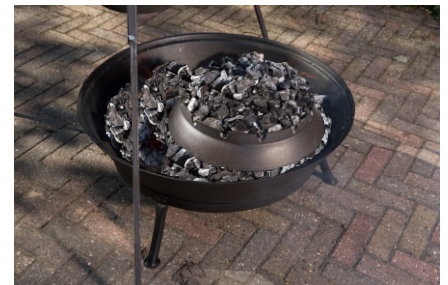
Cover the lid with hot coals