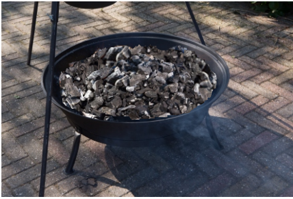
Burn the coals to a glow