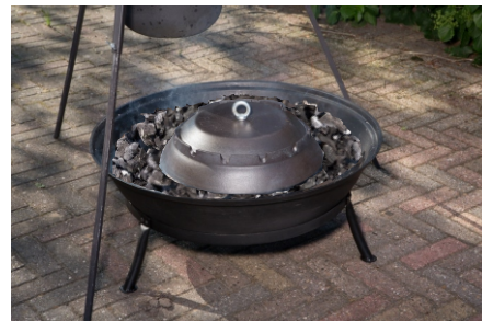
Put on the lid