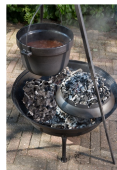
The cooking time is approx, 45 / 60 min.