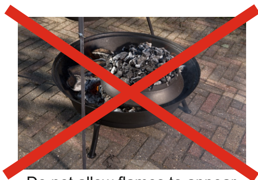
Do not allow flames to appear, only hot coals as flames can damage the Vesuv