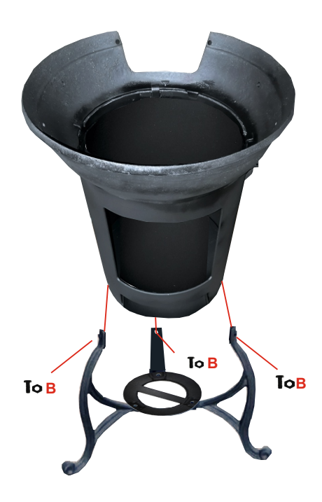
2. Turn fire pot upside down to fix legs and tighten all screws (B & C)